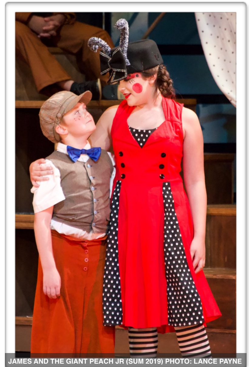
JAMES AND THE GIANT PEACH JR (SUM 2019)

DON'T FRET, FALL 2020 INFORMATION IS COMING YOUR WAY JULY 4TH!