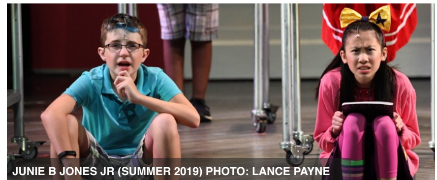
JUNIE B JONES JR (SUMMER 2019)