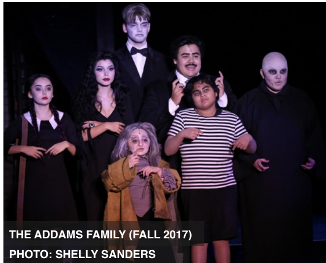
THE ADDAMS FAMILY (FALL 2017)

Students will learn the ins and outs of preparing and practicing a performance monologue for auditions, contest, or just for fun! In this performance and observation based class, students will be expected to both perform, and watch their fellow students to give constructive feedback. The goal will be for each student to leave with a classic and contemporary monologue to add to their toolbox.