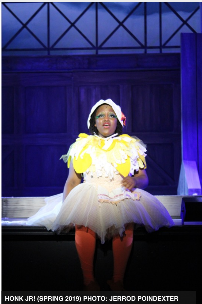
HONK JR! (SPRING 2019)

Spend Spring Break with Lyric Theatre! Each level will have tons of fun with beloved musical theatre selections as they practice vocal techniques, learn dance combinations, and brush up acting and performance chops. Veterans and newcomers are all welcome. We will have a special performance on Friday to show off everything the campers have learned.