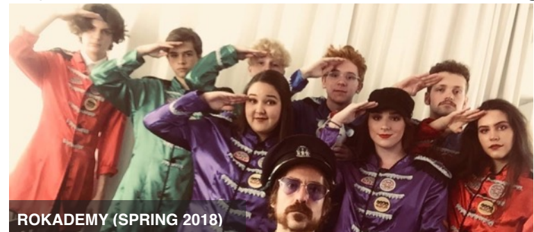
ROKADEMY (SPRING 2018)