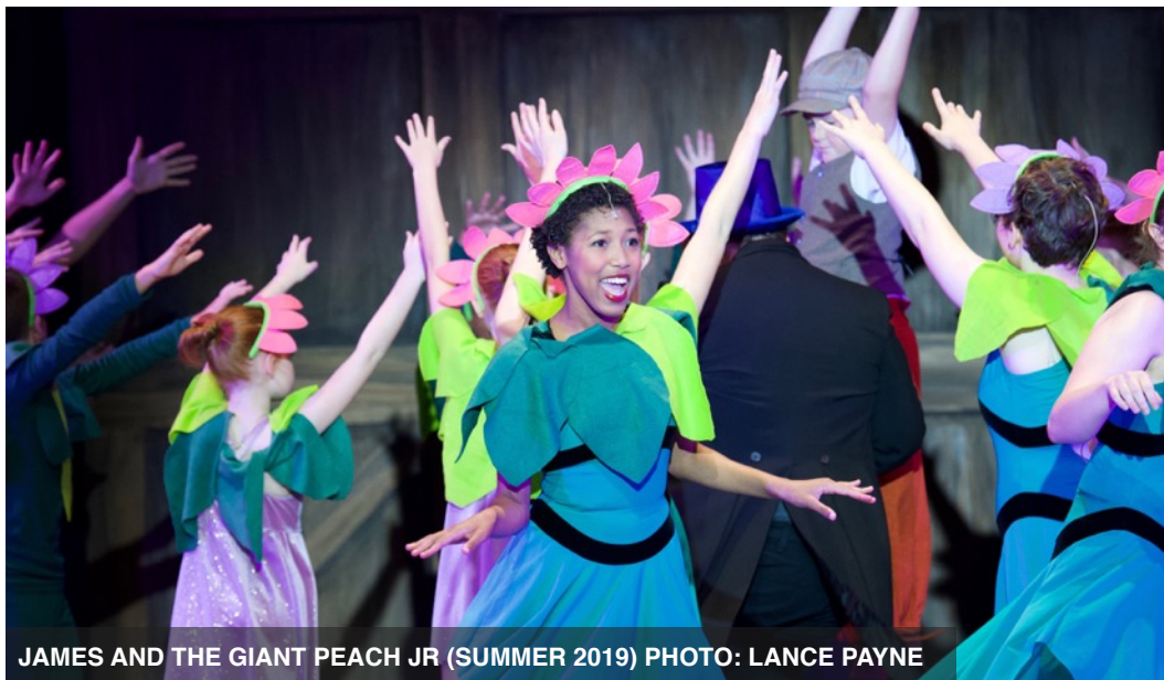
JAMES AND THE GIANT PEACH JR (SUMMER 2019)

Students will improve their Musical Theatre skills with the clear goal of performing in full-scale musical productions. Focusing on vocals and acting the part, this class will help prepare students for both rocking as an ensemble as well as standing out with the skill set of a lead performer.