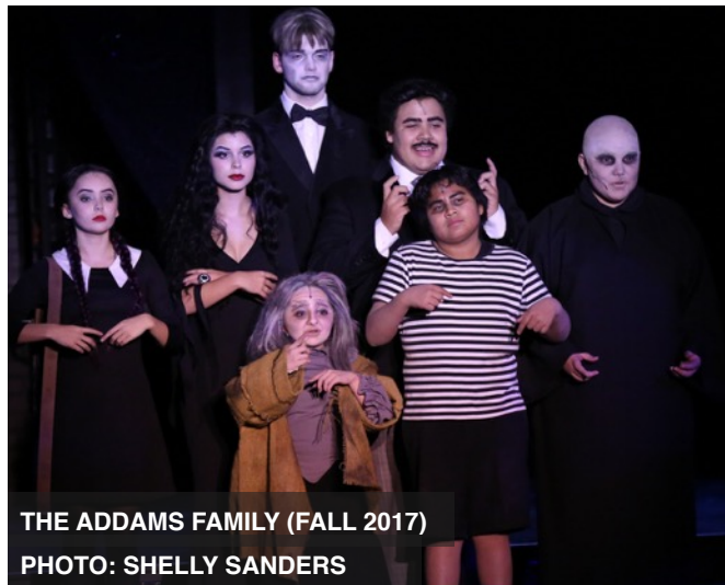
THE ADDAMS FAMILY (FALL 2017)

Improvisation II is meant to continue growing skillets from Improvisation I with a quicker and more fast paced start to the semester that bypasses the introductory weeks of class. Students will be challenged to create bolder and clearer choices focusing on growth of the Improvisation skill set and how it can translate to the rehearsal room.