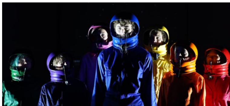
Kaleidoscope by Ray Bradbury, fall play 2023

***Recommended for HS Juniors and Seniors