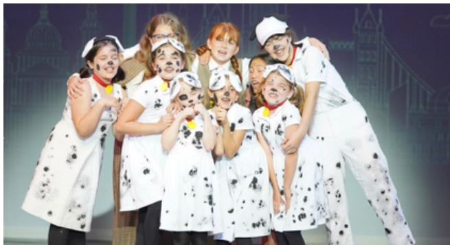
101 Dalmatians KIDS, fall 2023

Acceptance into all Production Classes and the Academy Professional Artist Training track is by audition only. Our goal is to give each student the opportunity to excel, and therefore, it is important for each student to have the training, experience, and maturity necessary to achieve success. We will evaluate each student and recommend the appropriate classes, productions, and roles based on what will best suit each student's needs and abilities.