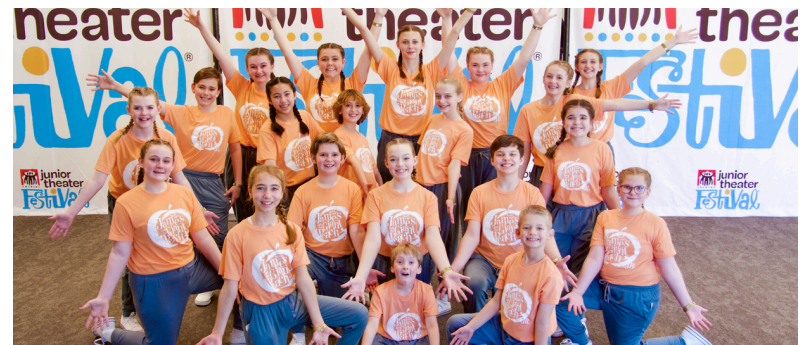
JTF team 2023-2024