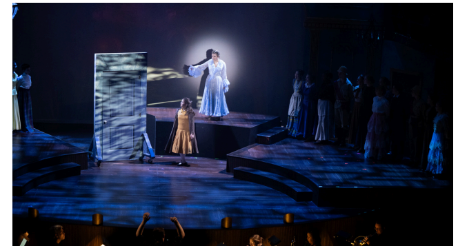
The Secret Garden, fall 2023