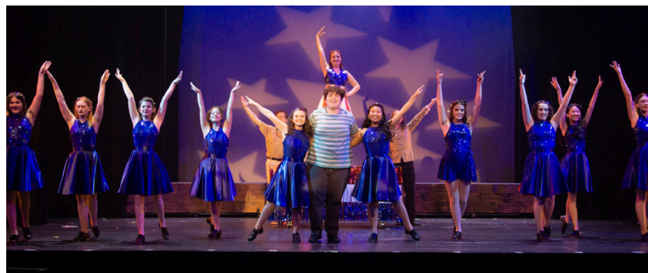
Big Fish, spring 2023

Tap is always a fun experience! These classes are very full, active, high energy dance classes. Skill level is broad for these tap classes. We are happy to bring back the split level classes and welcome beginners to Tap 1! Tap 2 students should be at least intermediate level before moving up. If you're not sure which level to choose, please email Rozz@LyricTheatreOKC.org .