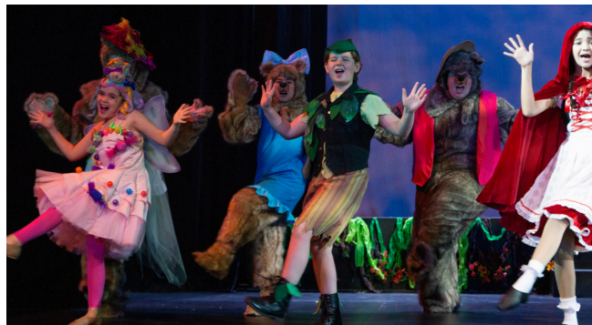
Shrek JR, spring 2023