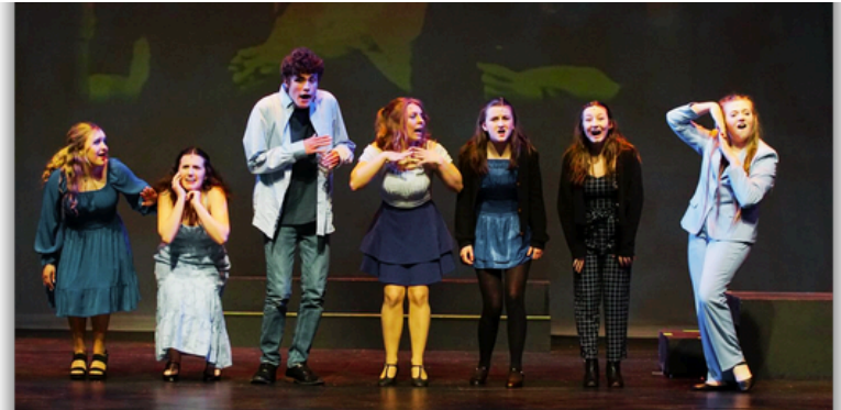
Sondheim on Sondheim, APAT capstone project, 2024

***Recommended for HS Juniors and Seniors