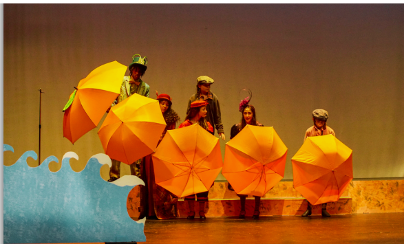
James and the Giant Peach JR, summer 2024

Acceptance into all Production Classes and the Academy Professional Artist Training track is by audition only. Our goal is to give each student the opportunity to excel, and therefore, it is important for each student to have the training, experience, and maturity necessary to achieve success. We will evaluate each student and recommend the appropriate classes, productions, and roles based on what will best suit each student's needs and abilities.