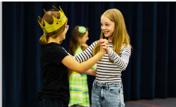
Cinderella Spring Break Camp, 2024