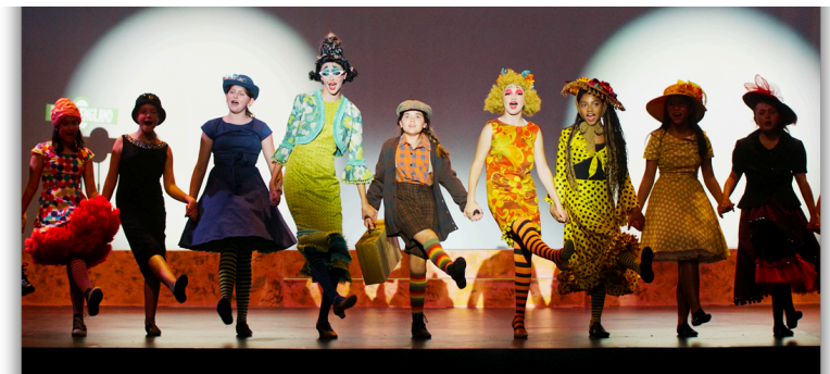
James and the Giant Peach JR, Summer 2024