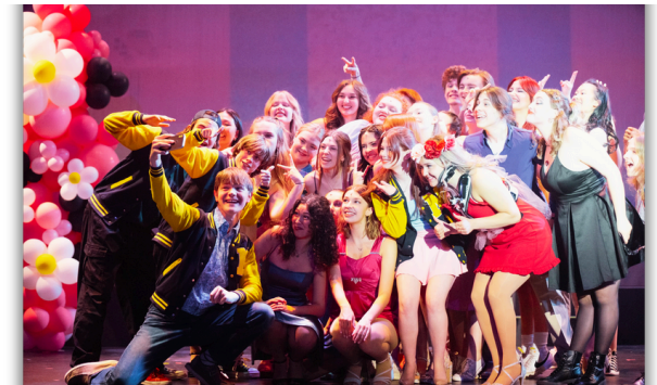
Mean Girls High School Version, spring 2024