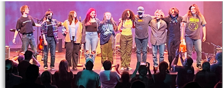
Jagged Little Pill concert, The RoKademy Experiment, Spring 2024

Private instruction is available to provide extra training and study in vocal technique and acting. Private lessons are one-on-one with the instructor in their studios in the Plaza Theatre or in the Academy building. Lessons do not roll to the following semester. Semester, double semester, and single block are the only lesson amounts available. The private lesson semester begins 1/6. Contact the office to be matched with a teacher.